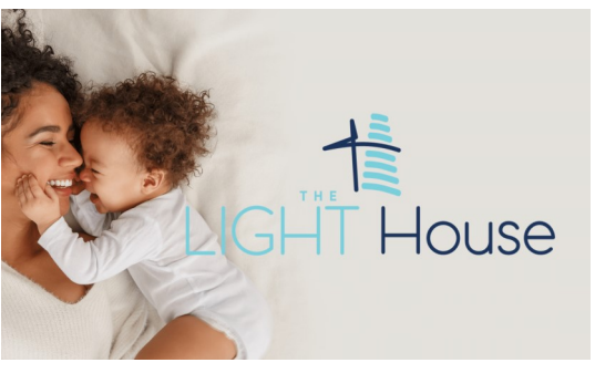
Encouragement In Christ, Care, Love

The Light House is now a part of Missouri Baptist Children Home (MBCH). MBCH is committed to serving God by responding to the needs of children, youth, and families to ensure all life is given hope for tomorrow. Services include Adoption, Community Based Resource, and a Residential Program/Maternity Home.